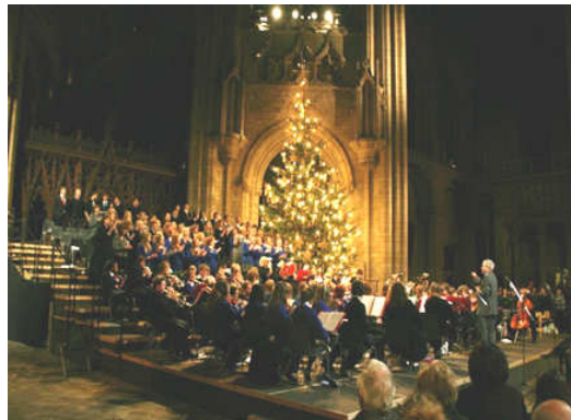
Ely Cathedral Christmas Concert