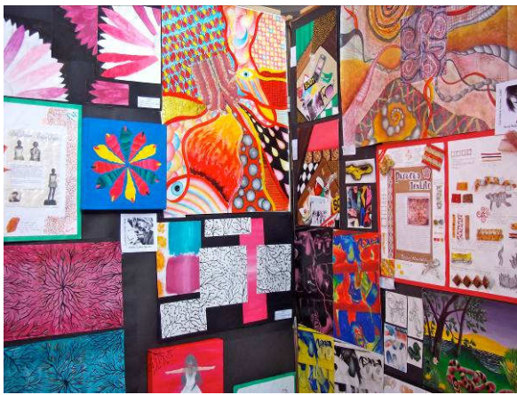
College Art Exhibition